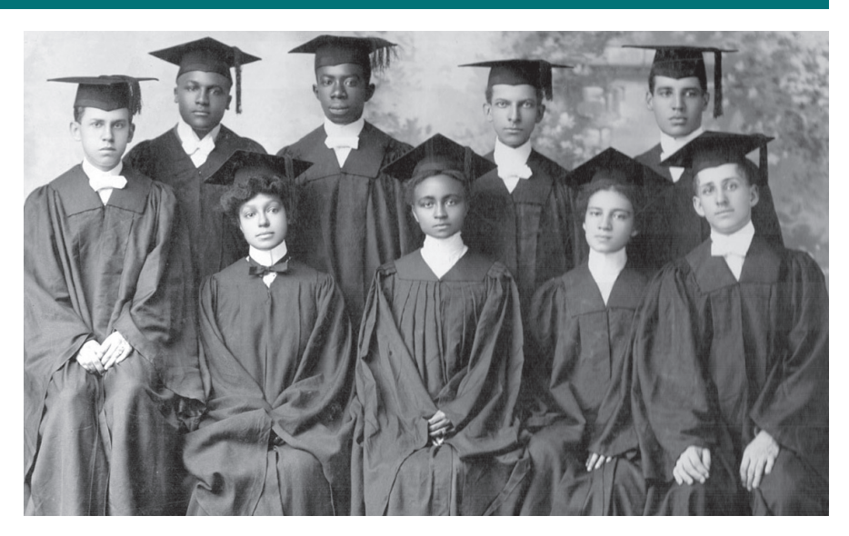
Independent Lens: Tell Them We Are Rising Community Screening Events Held